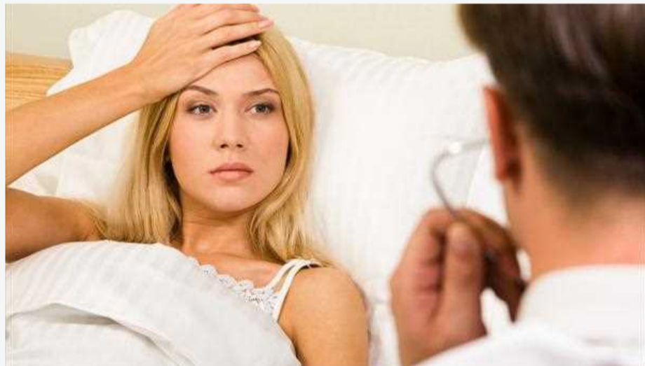
Instant Hemorrhoid Remedy